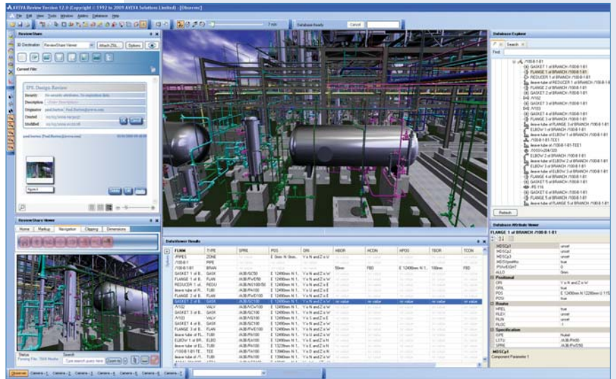
AVEVA ReviewShare integrates seamlessly with existing AVEVA products. Here, we see AVEVA ReviewShare (left) running within AVEVA Review to facilitate the capture and analysis of issues during the design review process.

© Copyright 2009 AVEVA Group plc. All rights reserved. RS/DS/09